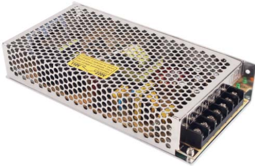
LMPS - 1