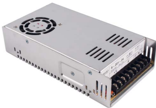
LMPS - 2